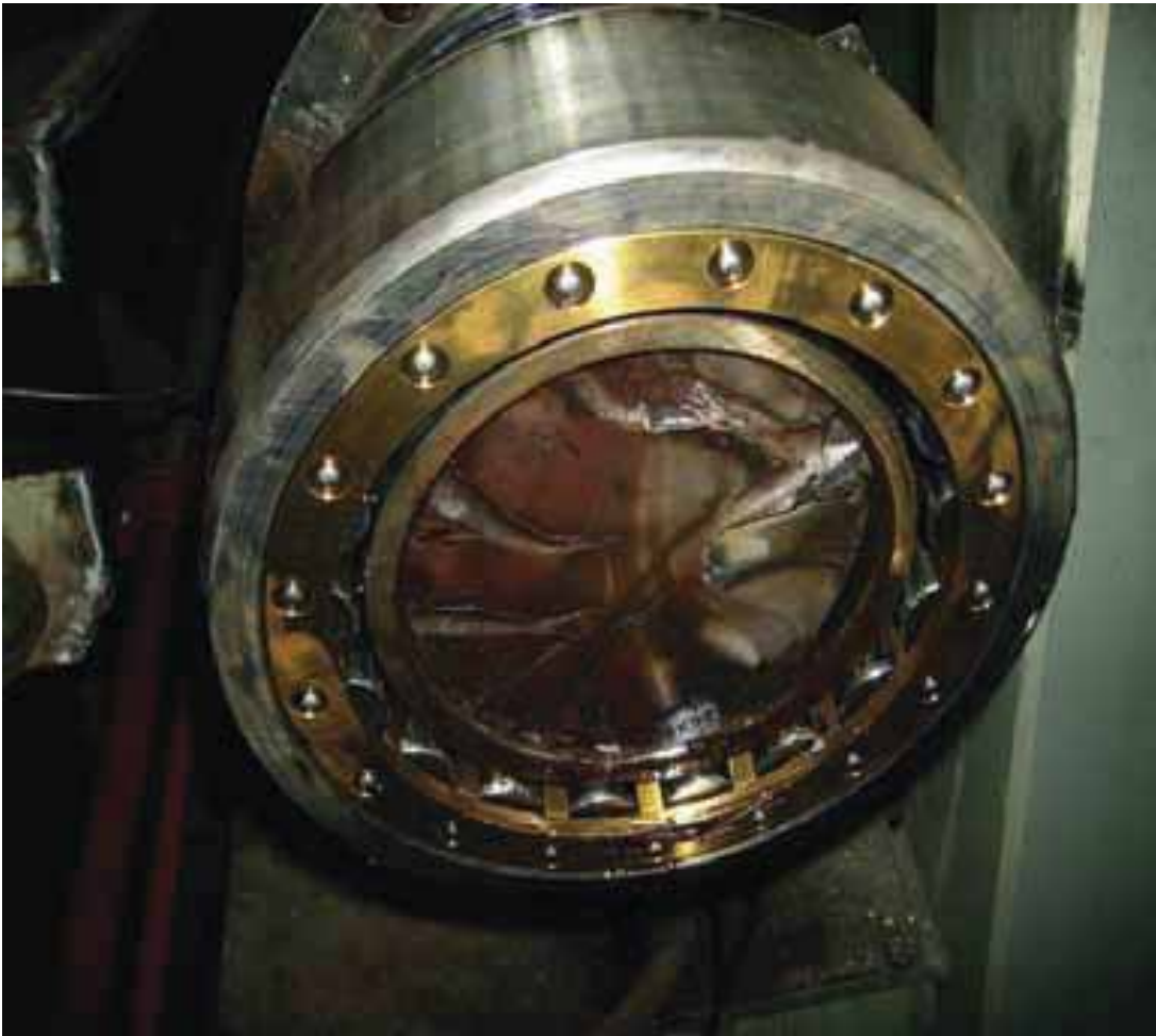
Photo of the shaft taken at Mauritius. (Note how it has sheared inside the inner race)

Once the Owners were informed it was decided to continue the voyage as it would have taken 10 days to reach Singapore, 8 days to reach Colombo, Sri Lanka or, 18 days to reach Cape Town, in the present sea state of 4, on one engine. However, as we progressed the weather deteriorated and the sea was onto the beam which made it very uncomfortable and of course affected our headway as we had to reduce load on the engine. By now there was no turning back as we were in the middle of the Indian Ocean and no other traffic in the vicinity. We were concerned as the weather forecast was not to our advantage but there was nothing we could do about the weather and continued altering course to make it as comfortable as possible as the weather deteriorated.