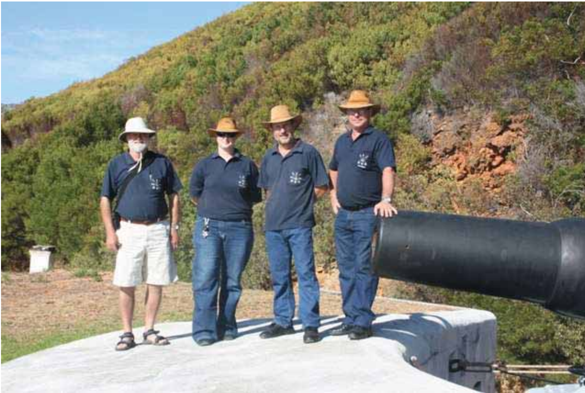
Canon Association members

History was made when the Canon Association of South Africa (CAOSA), restored and fired, the 9 inch wrought iron rifled muzzle loading gun. The Canon was fired, at the Middle North Battery Simon's Town at 11:00 am, on Wednesday 16 March 2011.