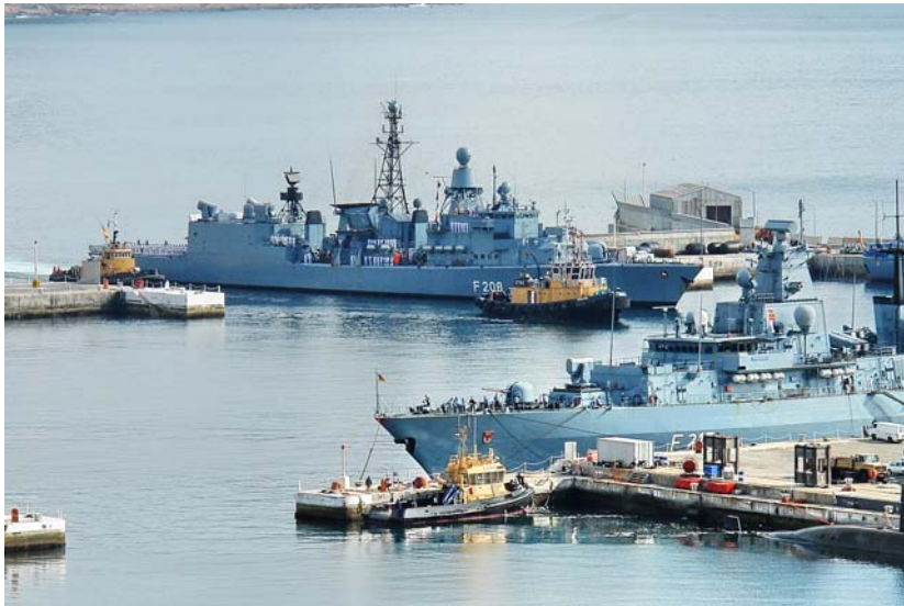
SIMON'S TOWN DOCKYARD BASIN SHOWING THE MEKO TYPE FRIGATE FNS BRANDENBURG ALONGSIDE WITH FGS NIEDERSACHSEN COMING THROUGH THE ENTRANCE, ATTENDED BY THE TUGS UMALUSI AND DE MIST . ONE OF THE DAMEN-DESIGNED MULTI-ROLE TENDERS IS SEEN ALONGSIDE IN THE STILL WATER BASIN IN THE FOREGROUND– PHOTO : DAVID ERICKSON.

NEWS FROM THE FLEET : Recently the Naval Base at Simon's Town chock-a-block with ships including a Task Force of four vessels of the German Navy for Exercise GOOD HOPE IV. The group includes the two frigates, FGS Brandenberg (built in 1994) and FGS Niedersachsen (1982), the modern 'one stop shop' RAS vessel FGS Frankfurt Am Main and the trusty ammunition carrier Westerwald , on her forth visit here. They will be conducting joint exercises and carrying out live missile firings at the Overberg Test Range, near Arniston, and six Tornado strike aircraft and two Learjet tracker aircraft of the Luftwaffe are already there.