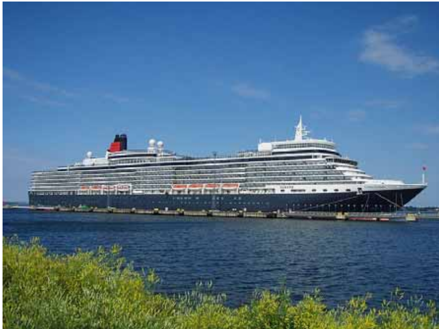
M V QUEEN ELIZABETH AT TALLINN.

M V QUEEN ELIZABETH : We are in Quebec tonight (28 September) and it is bloody cold. We have been up the Coast from New York and tomorrow we leave for Corner Brook, Nova Scotia, as our last port before crossing "The Pond" back to Blighty.