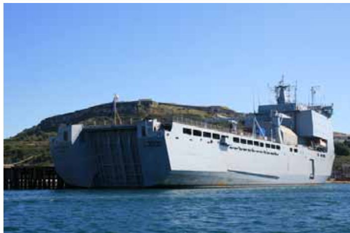
RFA LARGS BAY.

Having had to decommission their two ex USN Newport Class Amphibious Transports earlier than planned due to corrosion and poor maintenance, they urgently needed a replacement ‘lift’ to tide them over until the arrival of the two new build Canberra Class Amphibious vessels. As luck would have it, the UK’s 2010 Defence Strategic Review had just made one of their Bay Class Landing Ship Dock vessels, the 5 year old RFA Largs Bay (L3006), surplus to requirement and thus up for sale.