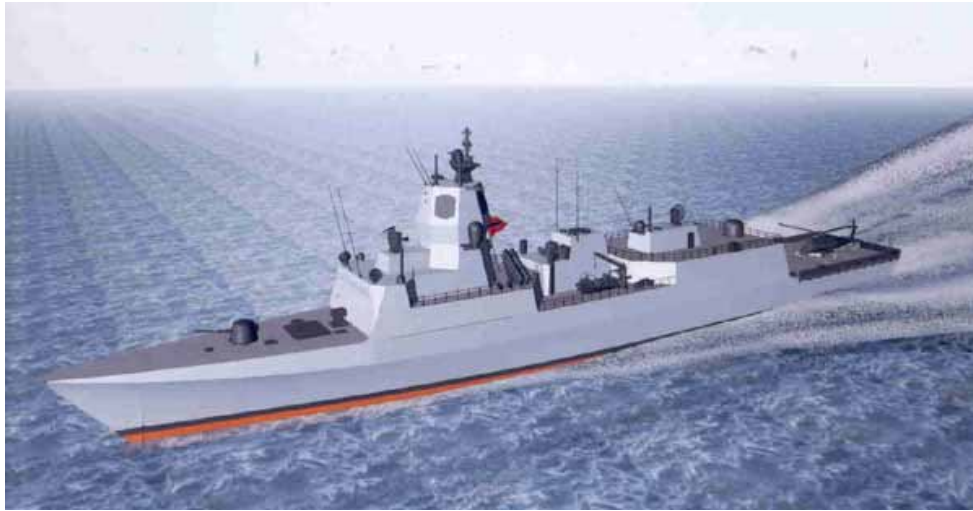
AN ARTISTS' IMPRESSION OF KNM FRIDTJOF NANSEN.

The FQR followed successful sea acceptance trials in Norwegian waters at the end of June. These, in turn, were preceded by a number of engineering trials, often undertaken during poor weather and adverse sea state conditions.